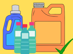
Empty Plastic Bottles & Jugs