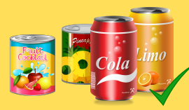
Empty Aluminium & Steel Cans