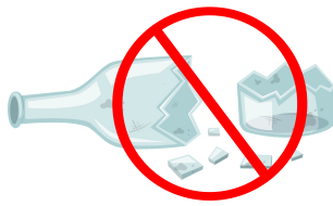
LOOSE GLASS/ SHARP ITEMS