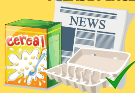
Clean paper & Cardboards

PLEASE PLACE RECYCLING IN YOUR NORMAL YELLOW LID BIN