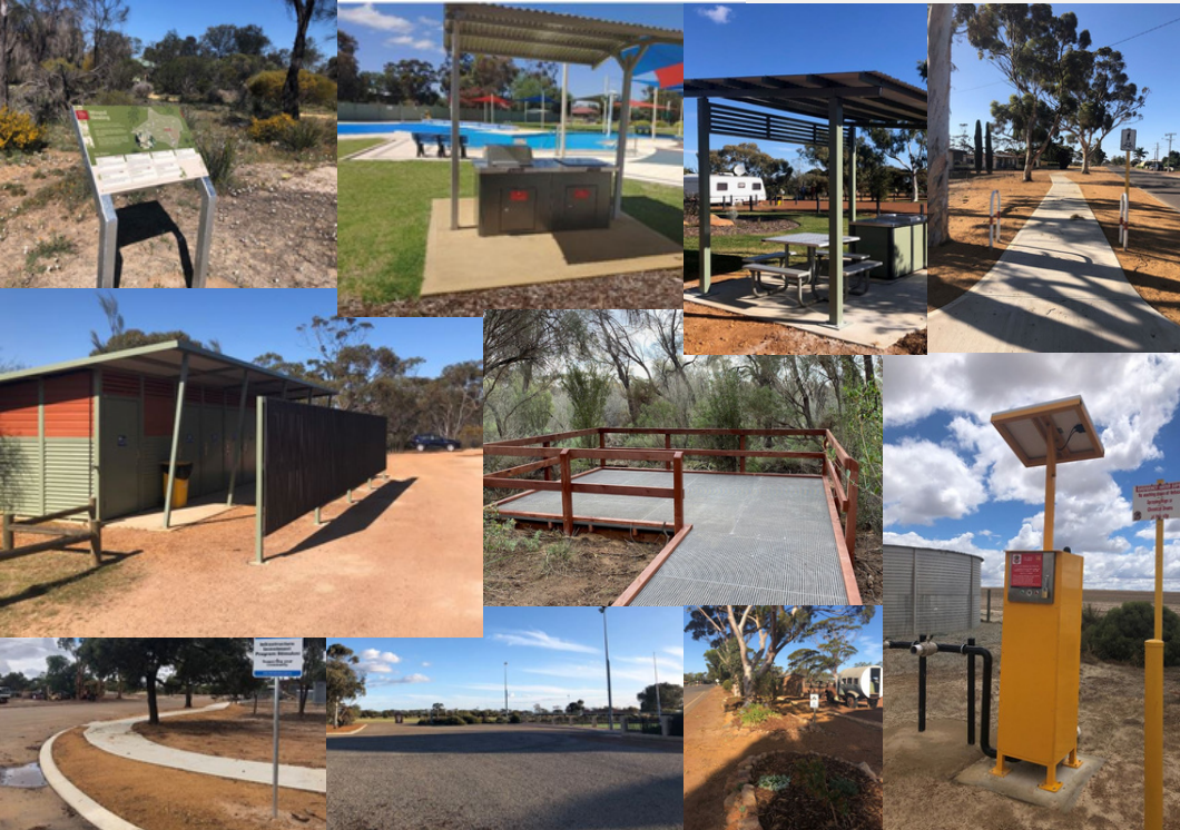
Local Roads Community Infrastructure Program (LRCI) Phase 1 & 2

PROUDLY PRODUCED BY THE SHIRE OF KONDININ