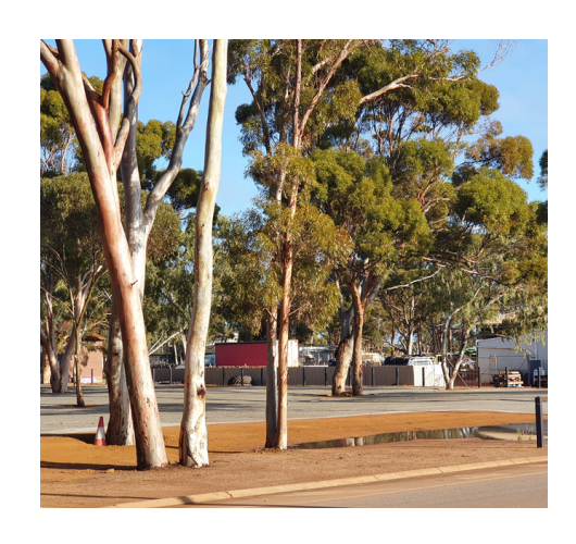
Until next time, travel safely.